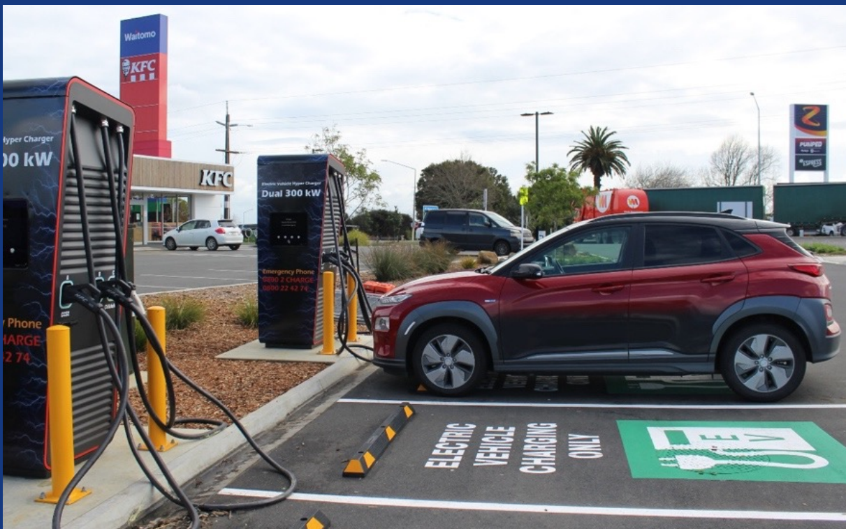
EV charging site Ross Holdings, Bombay New Zealand.

“EVs coming to my site gives me a competitive advantage over other close-by sites,” says Frost.