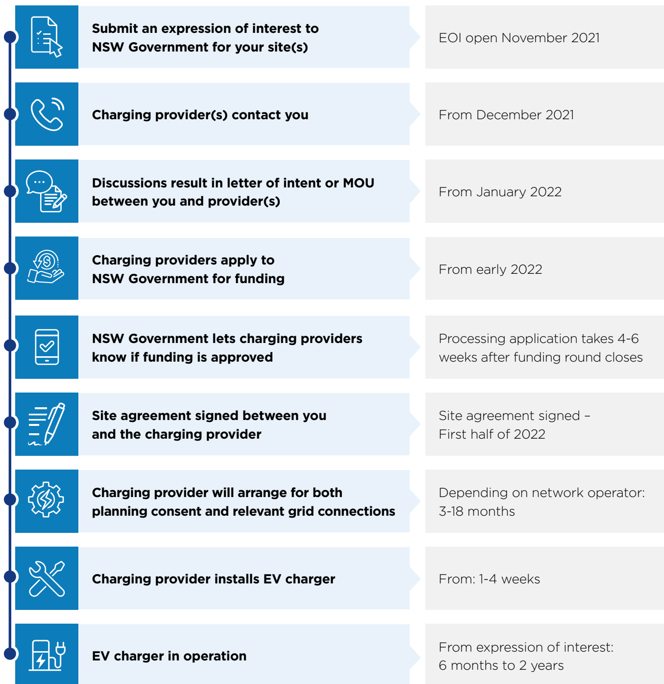
Figure 2. Process and estimated timelines.