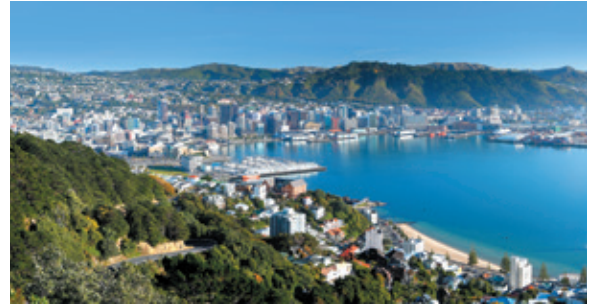
CLOCKWISE FROM ABOVE: Cruise through the Cook Strait on the Interislander Ferry; experience Maori culture in Rotorua; Wellington, New Zealand's capital city; the TranzAlpine rail journey.